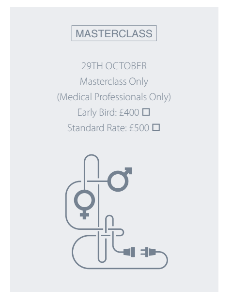
Early Bird rates apply for bookings made before September 1st 2017